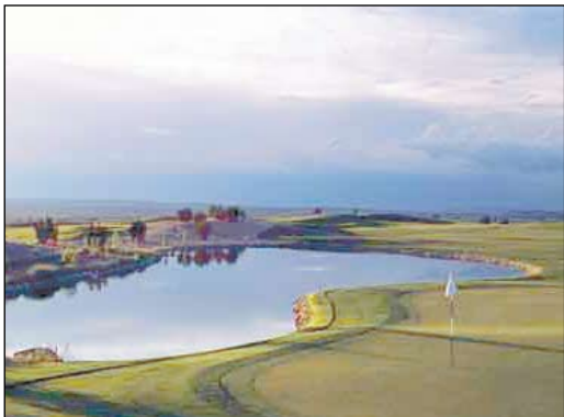
Spectacular high desert golf at Sandia Resort & Casino in New Mexico.

One of the coolest summer golf destinations close to Arizona is Albuquerque, New Mexico. Spectacular high desert golf, cool temps and great values highlight this emerging golf destination anchored by the Sandia Resort & Casino. Located just minutes from the airport, Sandia Resort & Casino features a world class golf experience that offers a visually stunning and strategic golf course designed by Scott Miller, complete practice facility and a 16,000 square foot "Pueblo" style clubhouse featuring restaurant, golf shop and expansive patio. Sandia opened in 2005 to rave reviews having been honored by Golf Magazine as one of the "Top 10 Best New Courses" you can play and winning the 2005 golf "Development of the Year" award from Golf Inc Magazine . The golf club at Sandia is a key amenity to the Sandia Resort & Casino that is already a popular gaming and entertainment venue. Featuring 228 luxurious, oversized guest rooms and over 30 suites, Sandia is highlighted by awe-inspiring views of the Albuquerque skyline and the rugged wildness of the Sandia Mountains.