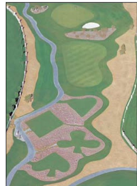
One of the most recognizable holes in Las Vegas, The Legacy's 10th features tee boxes in the shape of hearts, spades, clubs and diamonds.

in The Grille at Eagle Mountain, unlimited golf at Eagle Mountain Golf Club - Ranked the #1 Public Course in Arizona by Ranking Arizona 2006-2007 and complimentary practice balls prior to play. Certain restrictions apply so check out their websites at www.innateaglemountain.com or www.eaglemtn.com or call