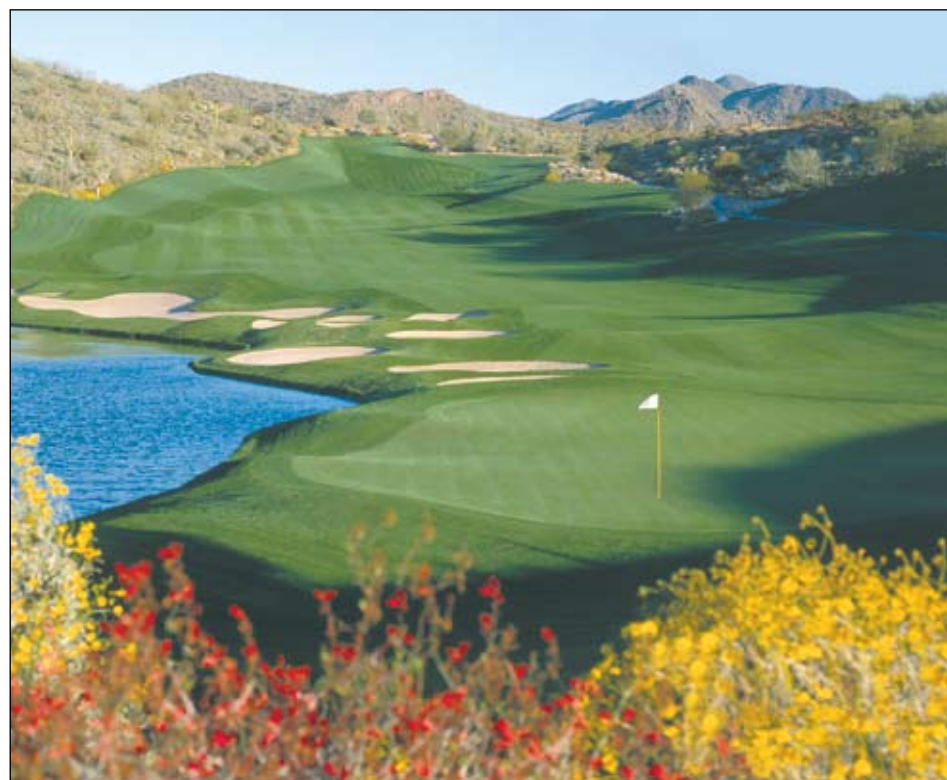
Guarded by eye-catching hazards to the right, the 18th hole of Eagle Mountain Golf Club plunges dramatically downhill from its lofty teeing area.

Take off for Las Vegas, Albuquerque, Indian Wells, or right here in Arizona