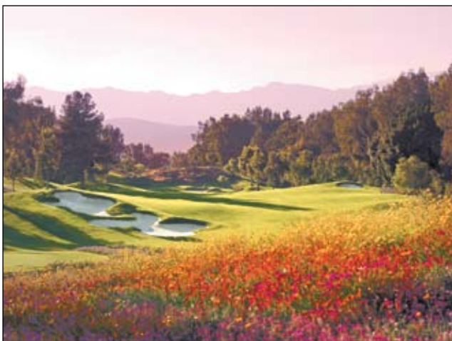
Indian Wells Golf Resort is just a four hour drive from Phoenix and is home to the LG Skins Game and four luxurious resorts.

Esmeralda Resort & Spa, Miramonte Resort & Spa and Hyatt Grand Champions Resort, Villas & Spa. Package prices start at just $107.50 (plus taxes, per person, based on double occupancy) and vary in price depending on the resort selected, number of golfers and date selection. For detailed information on golf packages at Indian Wells Golf Resort, visit www.indianwellsresort.com or call 760.346.4653.