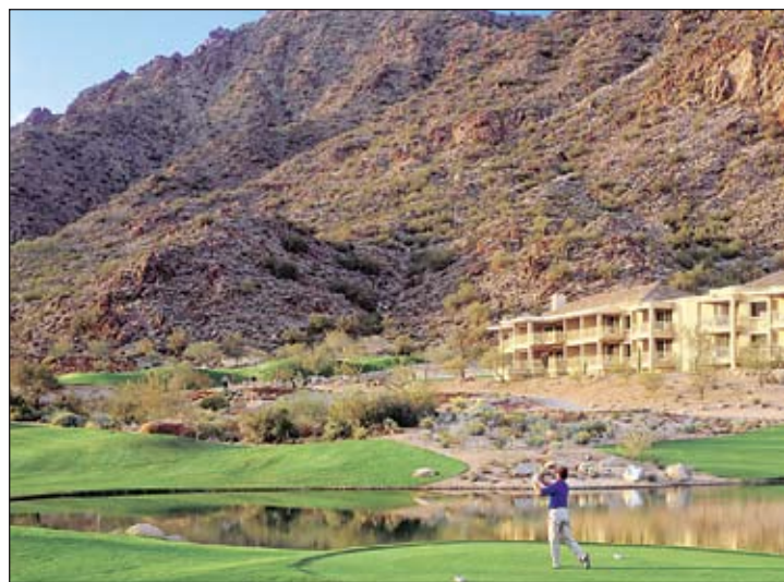
The Phoenician's Canyon Course

New this year is The Titleist Performance Institute Experience (TPI), which combines golf instruction with