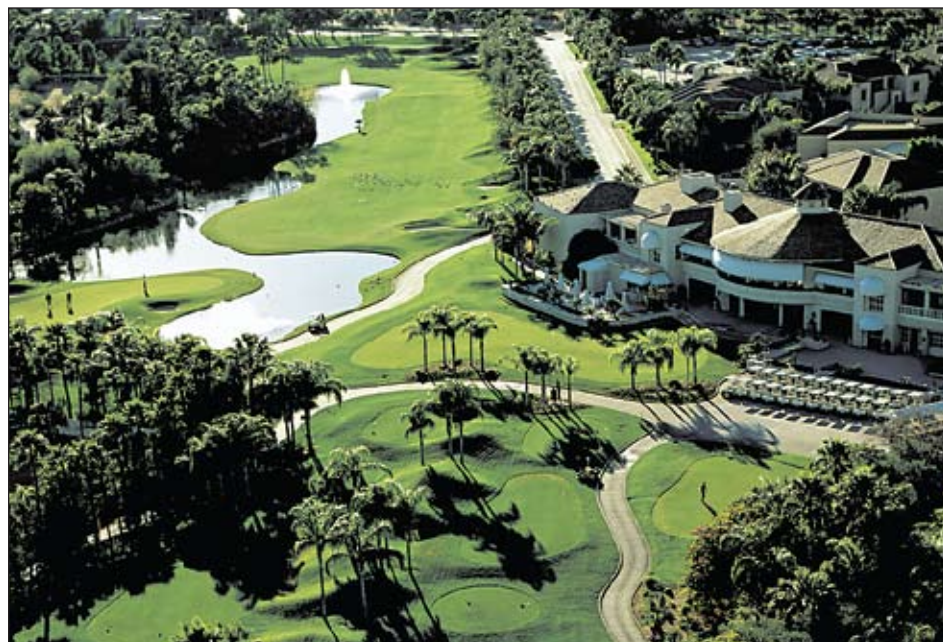
Clubhouse houses the pro shop, patio dining at Grille, and fine dining upstairs with views of their 19th hole.

Located at the base of Camelback Mountain, the 250-acre Phoenician offers two exquisite experiences – a 583-room AAA Five Diamond resort hotel and an