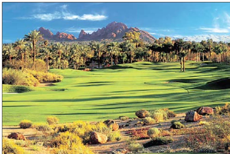
The Phoenician's Desert Course – Hole #9

Vacationers and 'Staycationers' can enjoy AAA Five Diamond accommodations; unlimited play on USGA championship course from $199