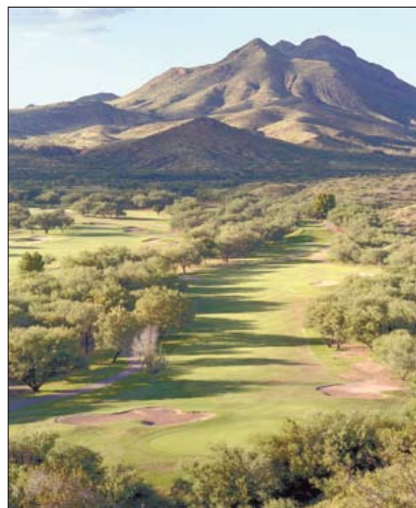
Rio Rico Country Club's Championship Course.

Horseback riding through the Santa Cruz River Valley along with their Mesquite Gulch - featuring campfire cookouts, a saloon, stage with gallows, and a corral take you back in history to the Old West. Taste the flavors and cooking