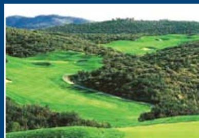
StoneRidge Golf Course

Take advantage of the beautiful weather and one of our amazing our Specials! Choose one of our specials below and experience 18 holes of Golf at one of the finest golf properties in Northern Arizona.