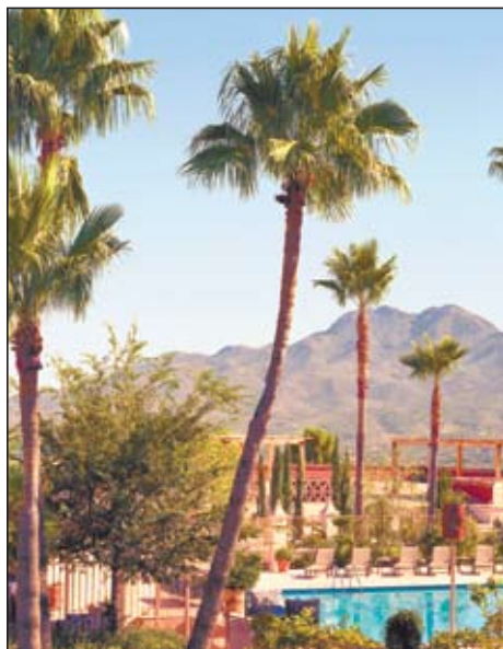
Secluded and relaxed atmosphere with beautiful vistas.